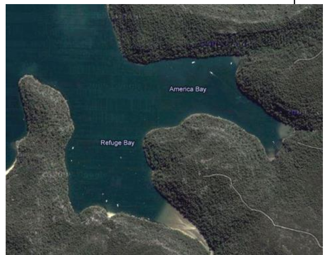
Brooklyn Marina Moorings – Approximate location

Spare boat hook is behind the stairs (pull stairs out) . Replacement of mooring pole is $40